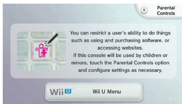
Above is an example of the Wii U Parental Controls screen.