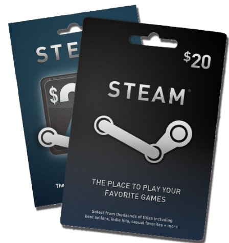
Above is an example of Steam's online store vouchers.

More information is available at Steam's Wallet page.